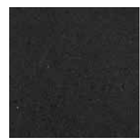
Majesta Black Primer: 1500