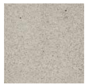
Yorkstone Primer: 1013-1L