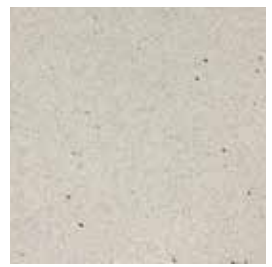
Lincoln Limestone Primer: 1500