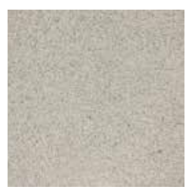
Valencia Ivory Primer: 3010-3D