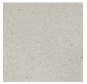
Vintage Carrera Primer: Q-851