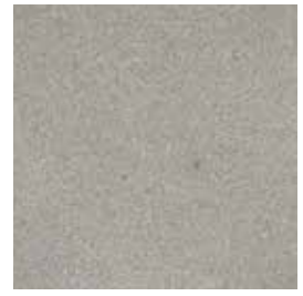
Mountain Cliff Primer: 1004-3D