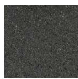
Frontier Primer: Q-851