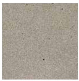
Formenterra Primer: Q-851