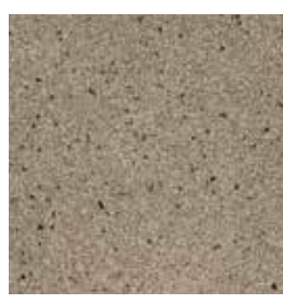
Feldspar Primer: Q-851