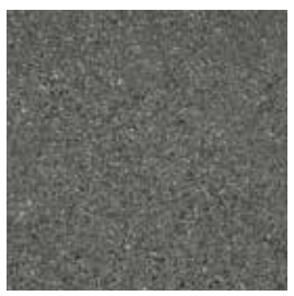
Rolling Thunder Primer: Q-851