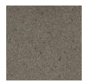
Dionysus Dark Primer: Q-851