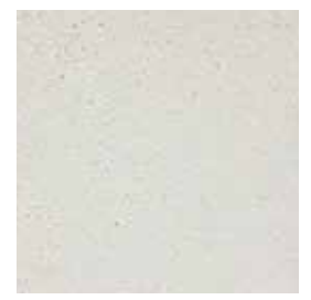
Augusta White Primer: 1004-3D