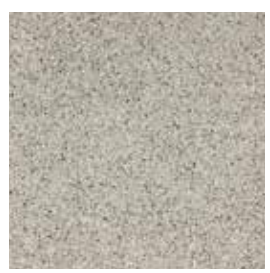
San Agustine Primer: 2009-1L